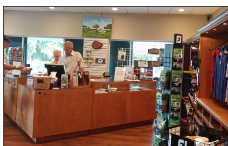
The Twisted Oaks Pro Shop before its facelift, and showing its new image today.